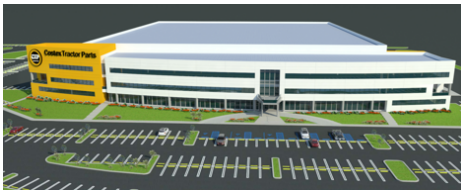
Rendering of Costex Tractor Parts new headquarters.