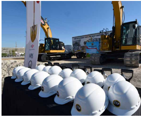
Hard Hats, representing hard work, commitment to safety, and the importance of team spirit.