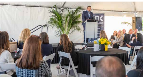
A focused audience listening to the vision and plan that CTP has mapped out for the next 18 months.