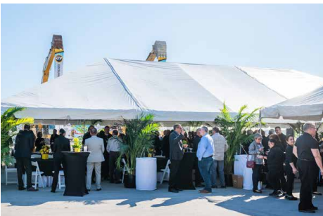
The celebrations started with delicious food and drinks for all to enjoy.