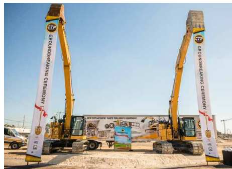
The Groundbreaking ceremony taking us to new heights.