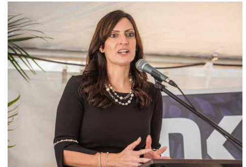
“I’m proud that I could be here with the Uribe Family, all business officers and community leaders, celebrating this historic moment for this company and all it represents here in our community” said Jeanette Núñez, Lieutenant Governor of Florida.

The project site will incorporate vast green areas, which will allow for walking, running and bike paths that will be spread over the 17-acre property to promote wellness amongst our employees. The building will also use locally sourced natural materials such as wood and stone in many of its design elements. When entering the main lobby you will come into an atrium which includes a central staircase with an expansive view of the Miami Canals, bringing the feeling of the “outdoors,” indoors.