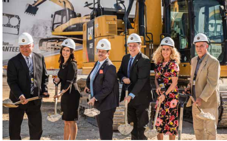
Shovels ready for action at CTP's Groundbreaking ceremony.