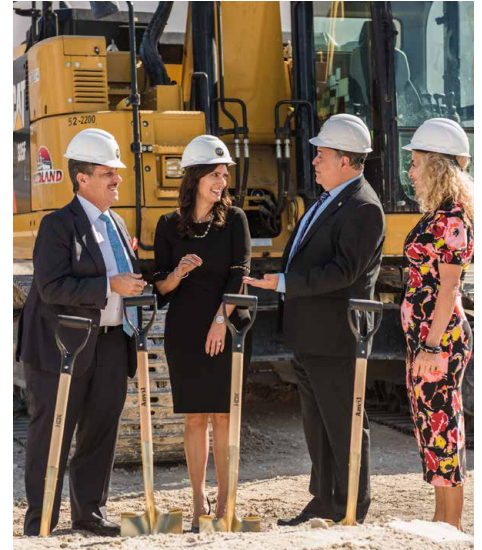
Dignitaries showing their support for CTP's groundbreaking project.