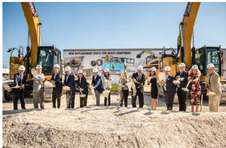
CTP and Dignitaries shoveling the foundation of the future.