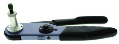
1U5804* Crimp Tool

* To ensure proper electrical performance, contact terminals must be crimped using crimping tool #1U5804, which needs to be ordered separately.